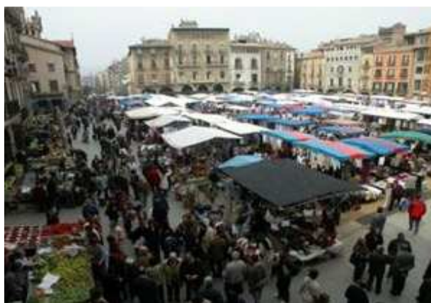
" El Mercadal "