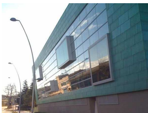
Council Pavilion "Castell d'en Planes" - outdoors -

Vic is a rich city on trade, Catalan culture and Tourism. Nowadays, the population is about 38.000 inhabitants, also, becomes a plural and rich city because of its geographical site and network system of transport as well. Recently the city believes in cultural and sports investments such as the University, Theatre-Auditorium "L'Atlàntida" and a creation of last year's new pavilion. This pavilion, named, Castell d'en Planes will be the European Roller-Skate Championships' headquarters in September.