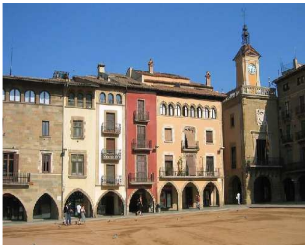
" Plaça Major de Vic "

Vic, capital city of the region of Osona. It is a city full of history, markets, fairs, gastronomy and cultural vitality gave its special attractive. The long history of the city bites all over it, streets, squares, historical center,...they have all style arquitectonical buildings like Roman Temple, the Pere III walls or the Cathedral.