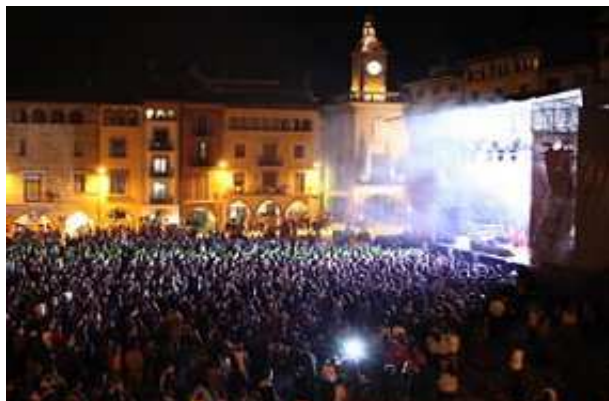
" Mercat de Musica viva "