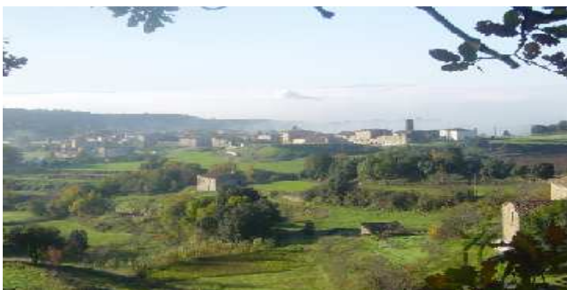
"El Lluçanès "