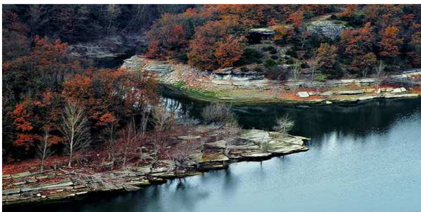
"El riu Ter"