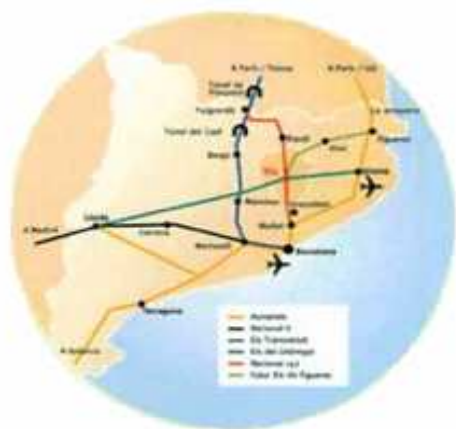
Airport of Catalonia

-Eixbus: busline Lleida-Girona, from Girona