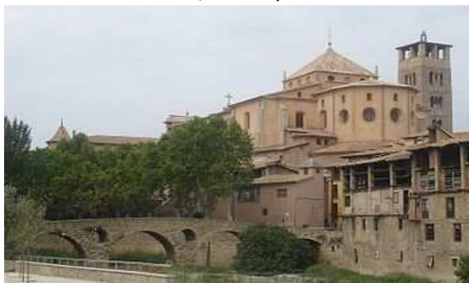
"La Catedral i el Pont Romanic"