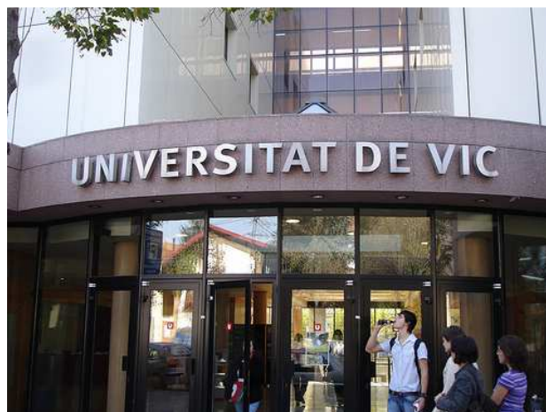
" Universitat de Vic "