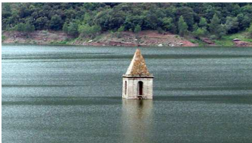
" El Pantà de Sau "