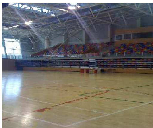
Council Pavilion "Castell d'en Planes" - indoors -